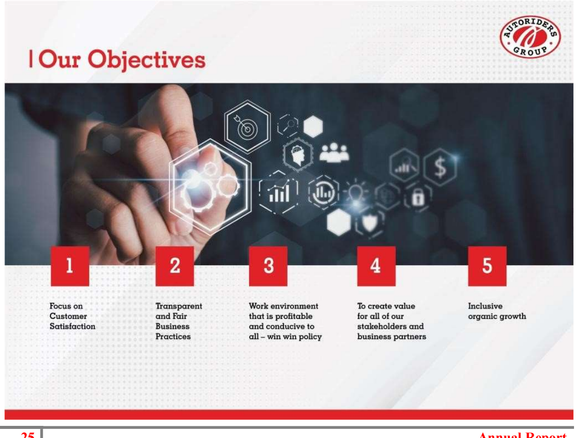
Annual Report 2022-23

During the Financial Year 2022-23, the company registered revenue of Rs.7055.72 lacs and profit of Rs.675.65 Lakhs as against revenue of Rs.3341.86 lakhs and profit of Rs.293.93 lakhs. India's travel and tourism industry has reached to the pre pandemic level and offers huge potential for sustained growth. With introduction of more digitalization and use of digital tools for planning, booking, and service delivery, travel & tourism industry is experiencing a huge fillip. India's rising middle class and increasing disposable income is expected to be a major factor for the future growth of domestic and outbound tours and travel. The transport business, comprising mainly of executive car rentals, is a major contributor to the growth of travel related services business.